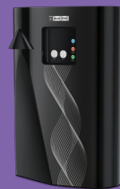
Pristina UV Water Purifier