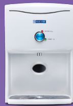
Prisma RO+UV Water Purifier