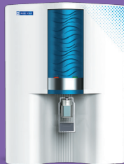
Mojesto RO/RO+UV Water Purifier with ATB