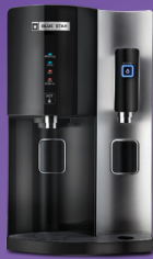
Stella RO+UV+Hot+Cold Water Purifier