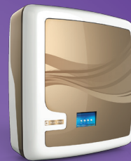
Edge RO+UV Water Purifier